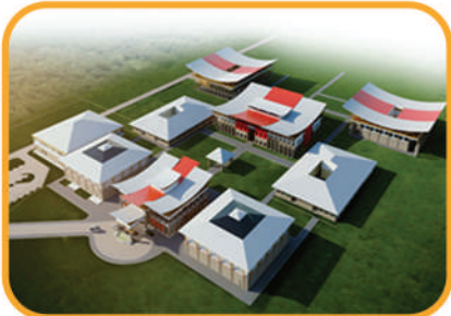
Mpesa Foundation Academy