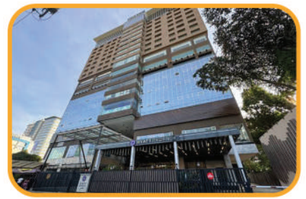
Hyatt Regency Hotel