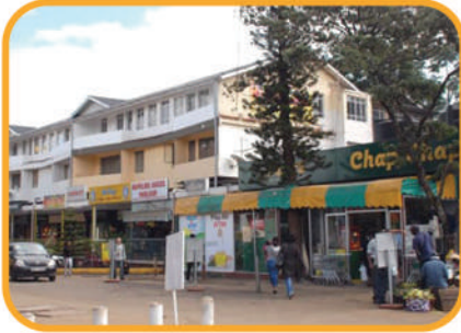
Valley Arcade Mall