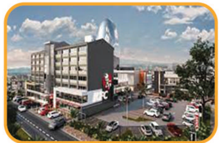
Westlands Square Mall