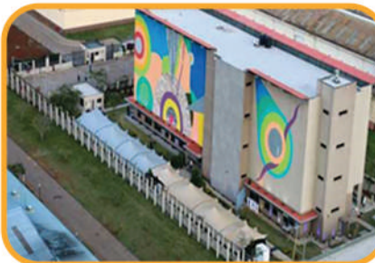
Africa Data Centre