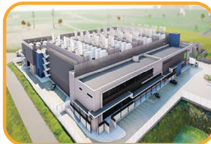
IXAfrica Data Centre