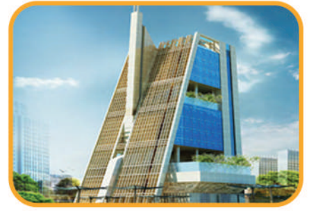
Trade & Development Bank