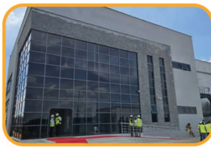
Safaricom Limuru Data Centre