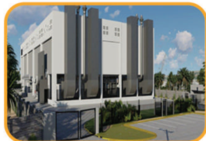
Icolo Data Centres