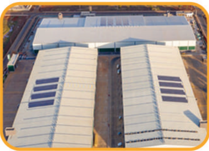
KWAL Tatu City