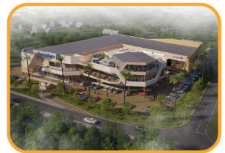
The Promenade Mall