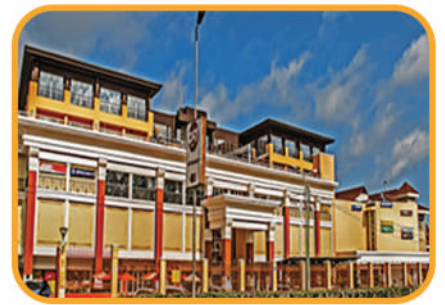
Nyali City Mall