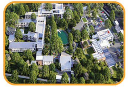
Red Cross HQ