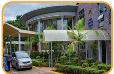
Lions Eye Hospital